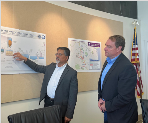
TOUR OF NOVATO SANITATION DISTRICT FACILITY