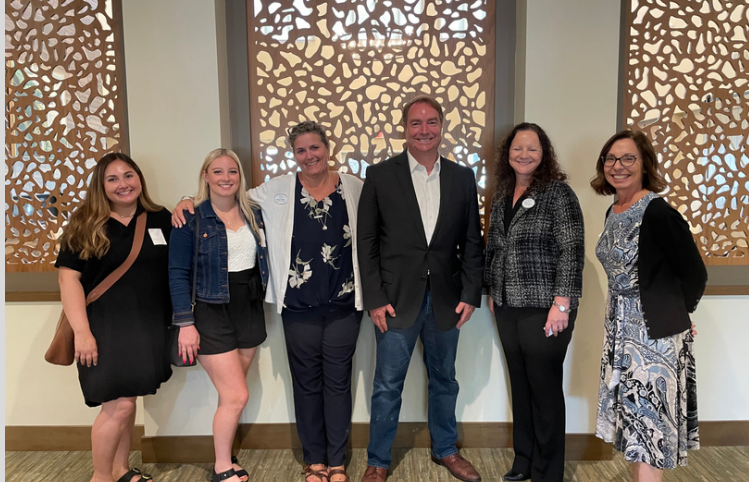
VISIT TO CLEARWATER SENIOR LIVING, SONOMA