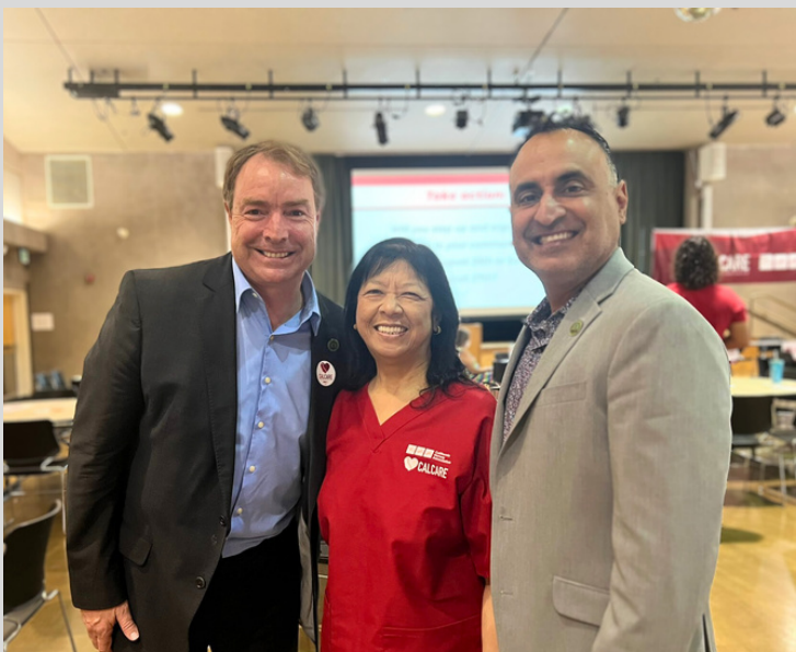
CALCARE TOWN HALL ON SINGLE-PAYER WITH ASSEMBLYMEMBER ASH KALRA