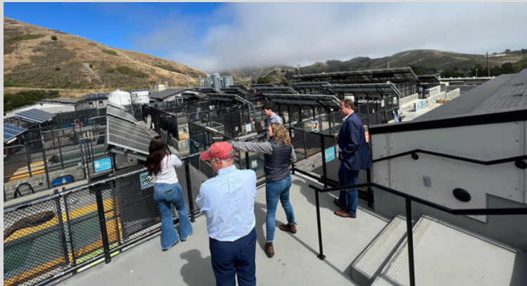
TOURING THE MARINE MAMMAL CENTER