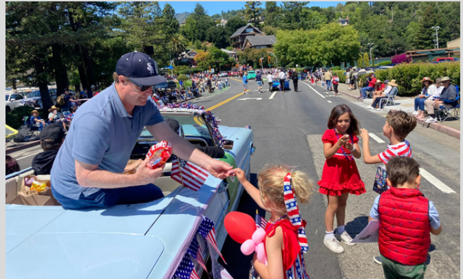
JULY 4 PARADES IN NOVATO & CORTE MADERA