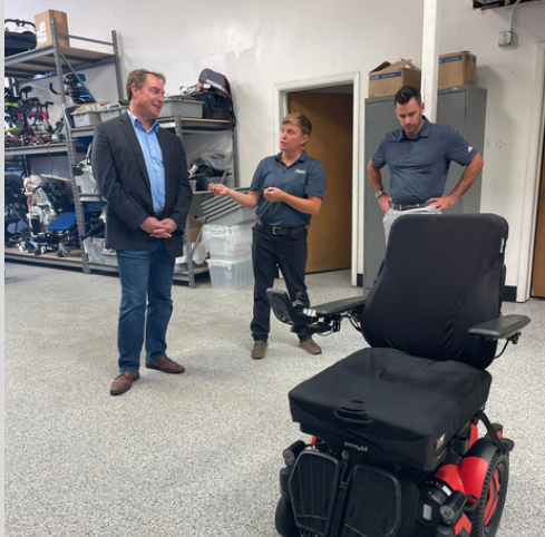
TOURING RELIABLE MEDICAL