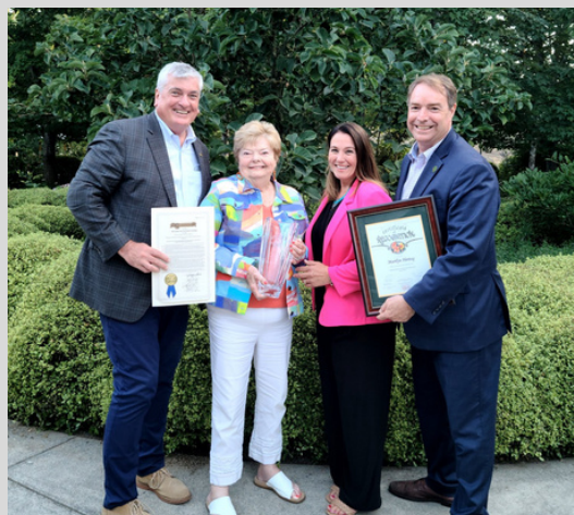
ATTENDING SONOMA FARM BUREAU'S "LOVE OF THE LAND" EVENT