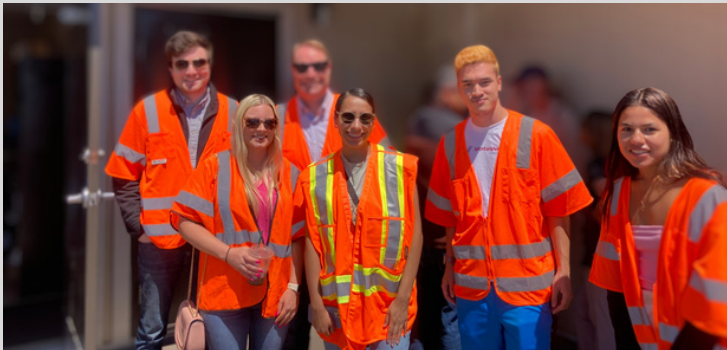
SMART TRAIN TOUR WITH DISTRICT INTERNS

Every year, the State Legislature has a Summer Recess, which spans for one month. This is a great time for legislators to spend time in their districts. I've had a fantastic time spending my first recess in the North Bay meeting with residents, touring local organizations, and hosting informational events. Below, are some snapshots & links from the past few weeks. We've been busy!