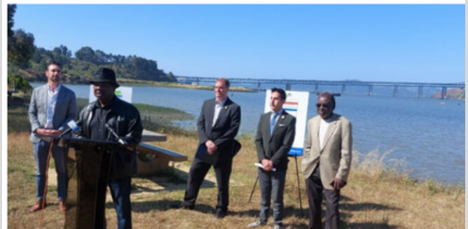
PRESS CONFERENCE ON REDUCING TRAFFIC CONGESTION ON THE RICHMOND-SAN RAFAEL BRIDGE