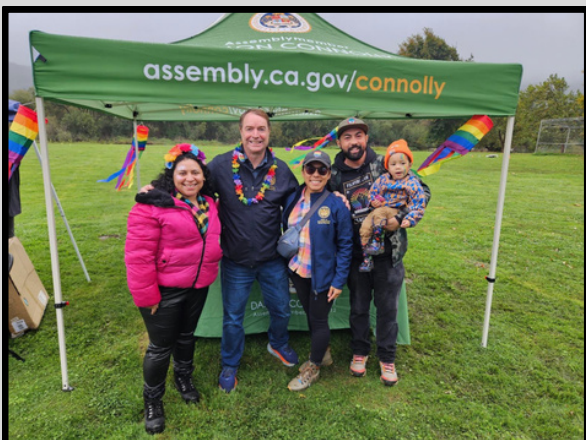
MARIN PRIDE FESTIVAL