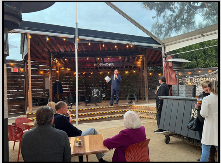
SPEAKING WITH MARIN COUNTY COUNCIL OF MAYORS & COUNCILMEMBERS