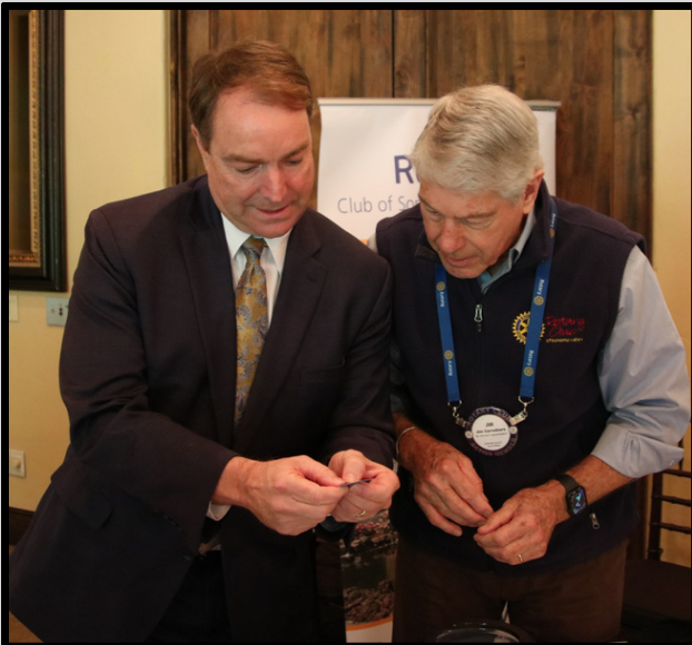
SONOMA VALLEY ROTARY CLUB MEETING