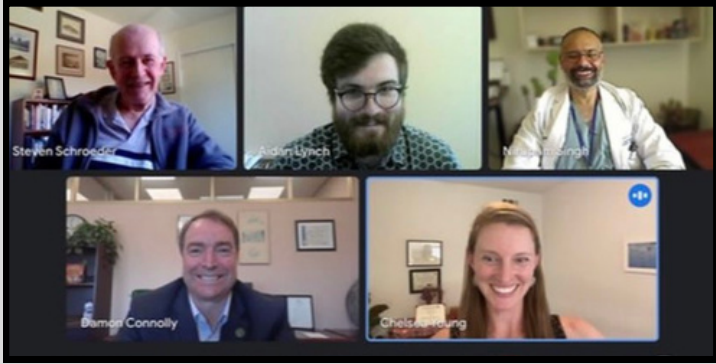
MEETING WITH CALIFORNIA CLIMATE HEALTH

During the legislative recess, we are back in the district full time, which has created great opportunities to attend events, tours, and productive meetings with constituents throughout the North Bay in both Marin and Sonoma Counties. Here are some snapshots of some of the meetings and events my office has participated in over the past month. As always, our door is open, if you want to schedule a meeting or send an event invite, please reach out through our website by clicking here .