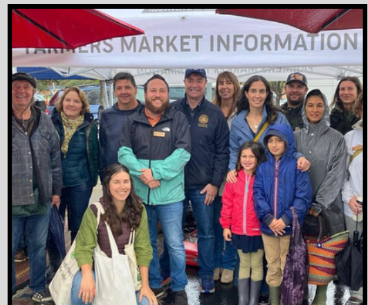
AGRICULTURAL INSTITUTE OF MARIN 40 YEAR ANNIVERSARY