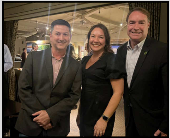
ADDRESSING CALIFORNIA WATER ASSOCIATION CONFERENCE