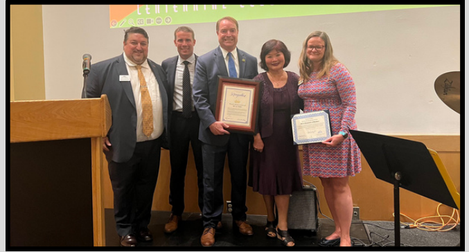
MARIN ASSOCIATION OF REALTORS, CENTENNIAL CELEBRATION WITH SENATOR MCGUIRE