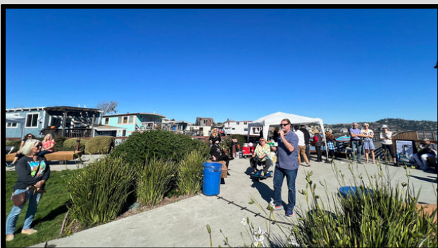
SAUSALITO FLOATING HOMES "DAY IN THE PARK"