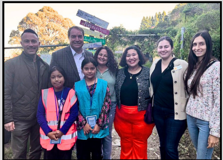
SAN PEDRO ELEMENTARY OPEN HOUSE