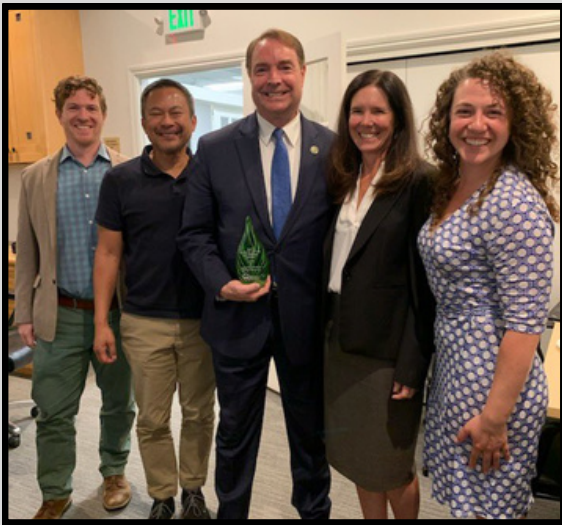
RECEIVING MARIN CLEAN ENERGY "CLIMATE ACTION LEADERSHIP" AWARD