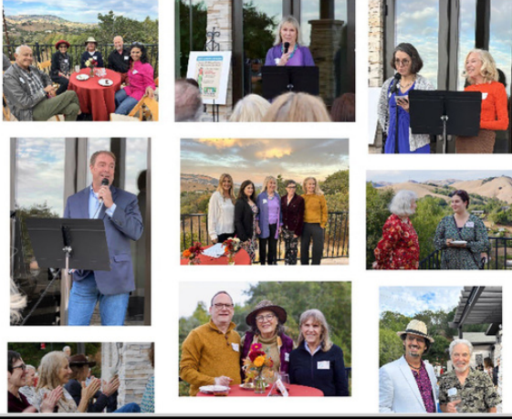
RESILIENT NEIGHBORHOOD PARTY TO SUPPORT CLIMATE ACTION PROGRAMS

With your help, we raised $25,015 to keep our award-winning Climate Action program free of charge.