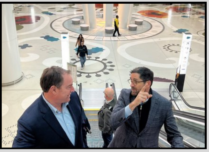
SALESFORCE TRANSIT CENTER TOUR