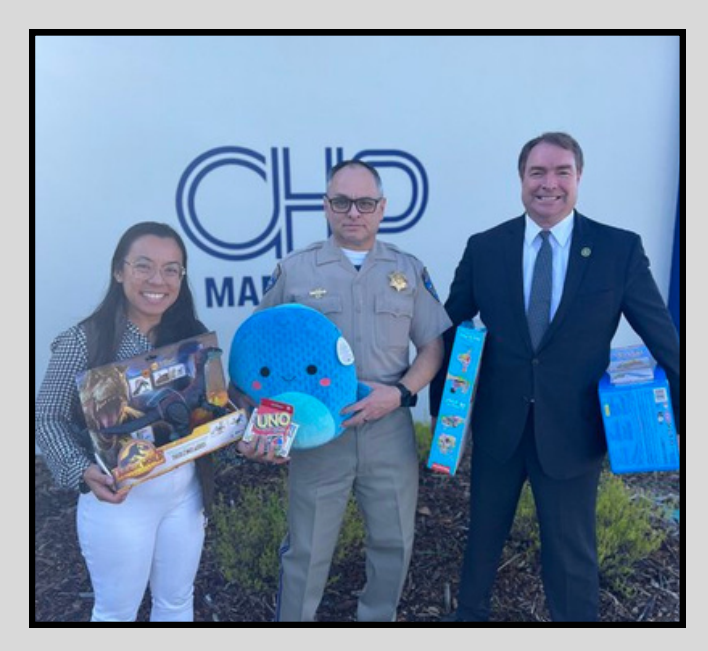
DONATING TO THE CALIFORNIA HIGHWAY PATROL'S "CHIPS FOR KIDS" TOY DRIVE

During the legislative recess, we were back in the district full time, which created great opportunities to attend events, tours, and productive meetings with constituents throughout the North Bay in both Marin and Sonoma Counties. Here are some snapshots of some of the meetings and events my office participated in over the past month. As always, our door is open, if you want to schedule a meeting or send an event invite, please reach out through our website by clicking <u>here</u>.