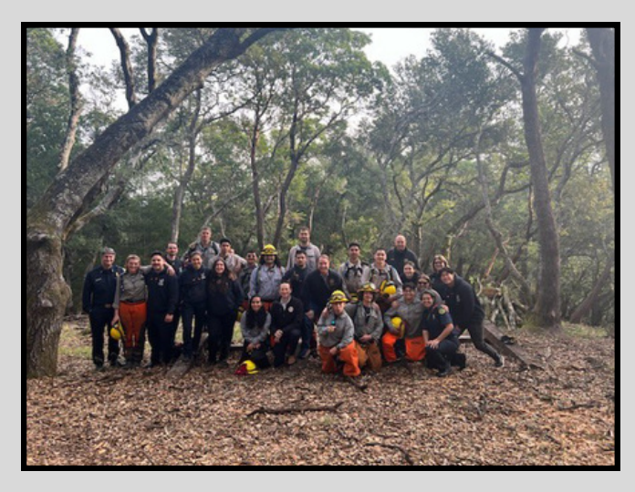
FIRE FOUNDRY RECRUITS IN ACTION CLEARNING LADDER FUELS IN FAIRFAX