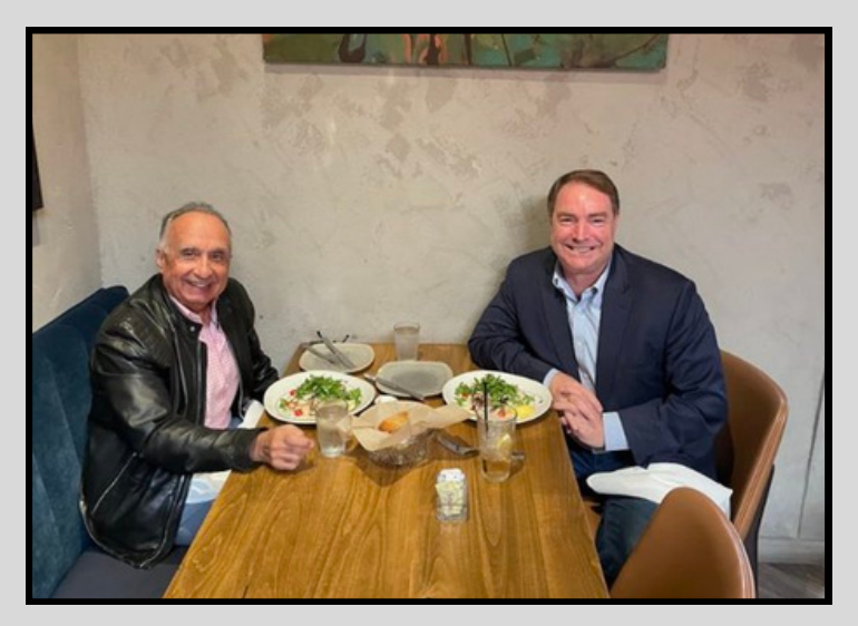
CATCHING UP WITH CONSTITUENTS