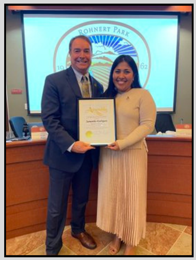
PRESENTING A CERTIFICATE HONORING THE OUTGOING MAYOR OF ROHNERT PARK, SAMANTHA RODRIGUEZ