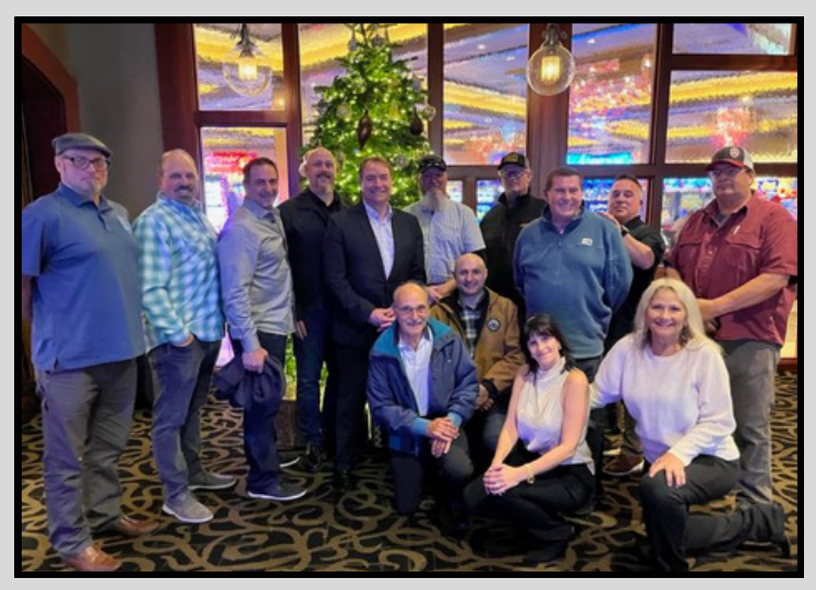
HOLIDAY LUNCHES WITH LOCAL LABOR LEADERS, INCLUDING LIUNA