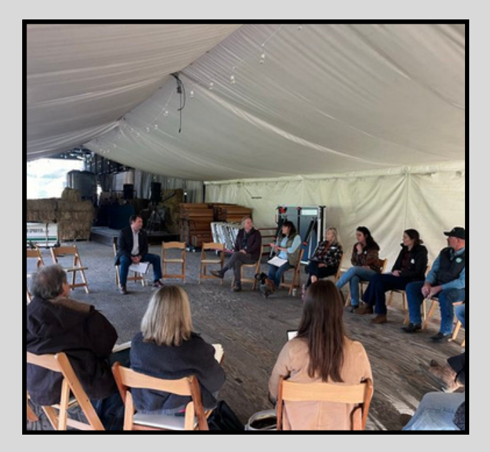
ROUNDTABLE AT TARA FIRMA FARMS FOR ORGANIC FARMING BILL