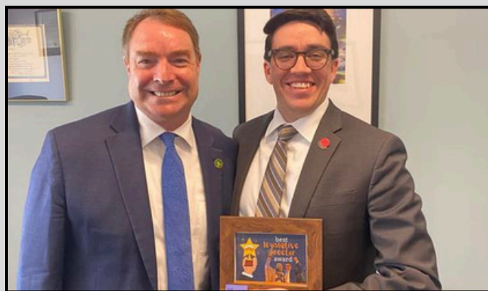
LEGISLATIVE DIRECTOR APPRECIATION DAY