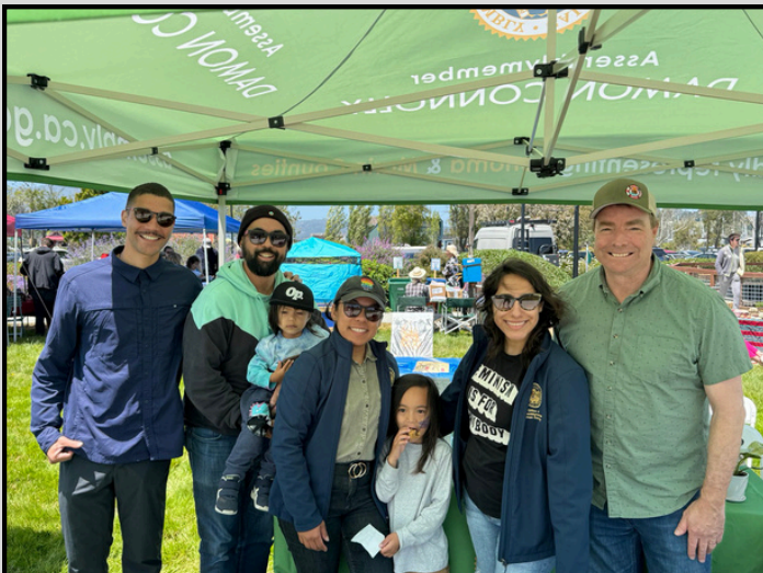
HOSTING AN EMERGENCY PREPAREDNESS BOOTH IN SAUSALITO