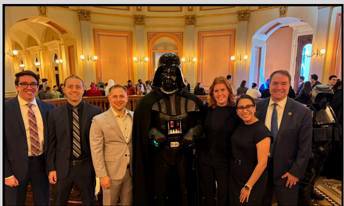
STAR WARS DAY AT THE CAPITOL