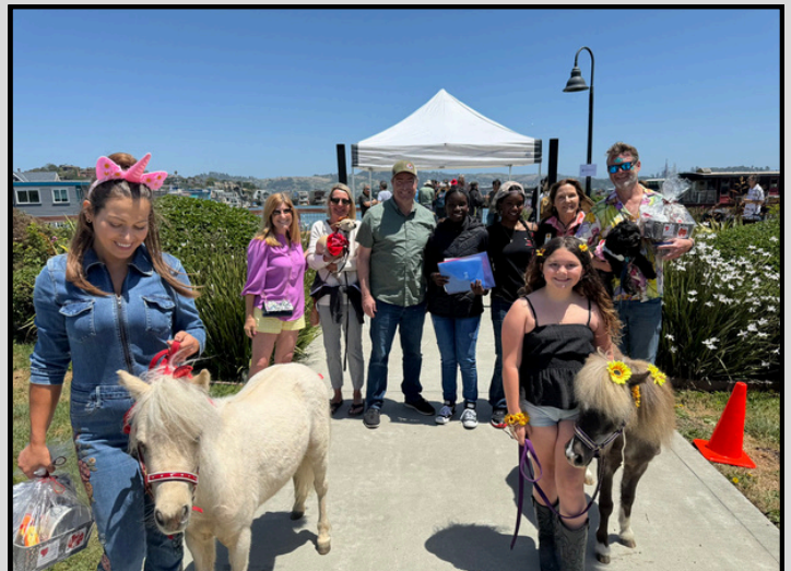
SAUSALITO FLOATING HOME ASSOCIATION DAY IN THE PARK