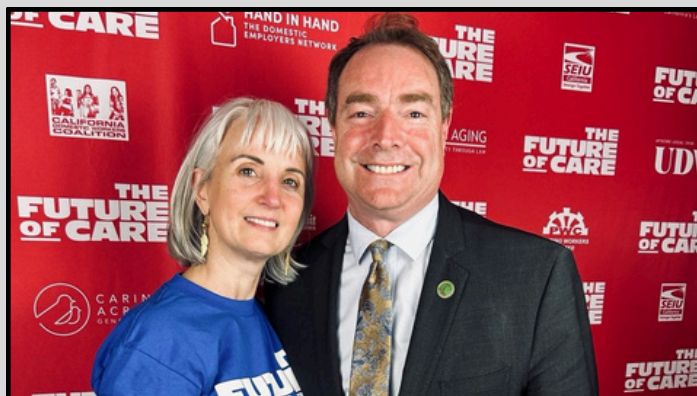
CALIFORNIA DOMESTIC WORKERS COALITION EVENT AND SCREENING