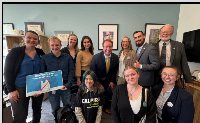
CONNECTING WITH CALPIRG STUDENTS ON THEIR LEGISLATIVE ADVOCACY DAY