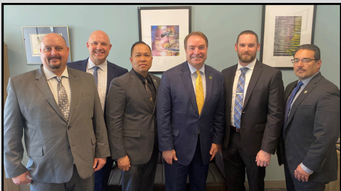
MEETING WITH THE NORTHERN CHAPTER OF PEASE OFFICERS RESEARCH ASSOCIATION OF CALIFORNIA