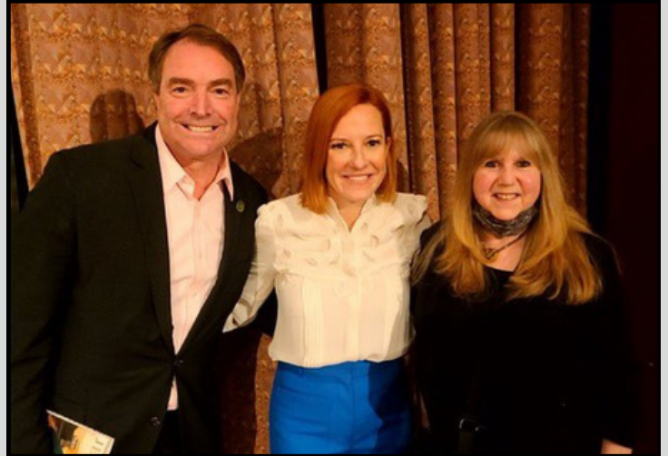
JEN PSAKI IN CONVERSATION AT DOMINICAN UNIVERSITY OF CA TALKING ABOUT HER NEW BOOK