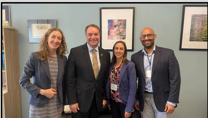
DISCUSSING HOUSING STABILITY WITH COMMUNITY ACTION MARIN