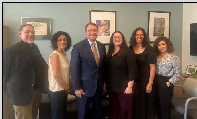
DISCUSSING LEGISLATIVE PRIORITIES WITH THE HABEMATOLEL POMO OF UPPER LAKE TRIBE