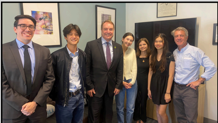
DISCUSSING WATER'S EDGE LEGISLATION WITH HILLSDALE HIGH SCHOOL ENVIRONMENTAL CLUB STUDENTS

It's especially exciting when I have the opportunity to meet with constituents from AD12 lobbying out in Sacramento! Here are some snapshots of some of the meetings and events my Capitol office participated in over the past month. As always, our door is open, if you want to schedule a meeting or send an event invite, please reach out through our website by clicking here .