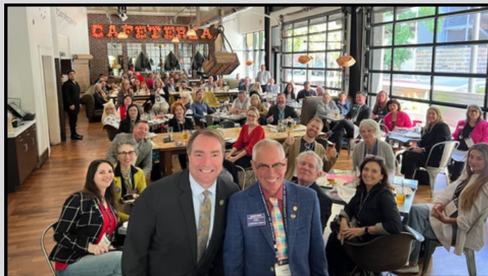
SPOKE AT THE CALIFORNIA ASSOCIATION OF REALTORS LEGISLATIVE LUNCHEON