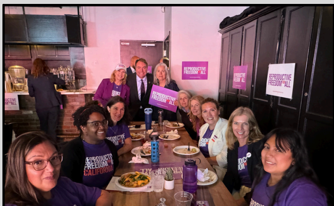
REPRODUCTIVE FREEDOM FOR ALL LEGISLATIVE RECEPTION