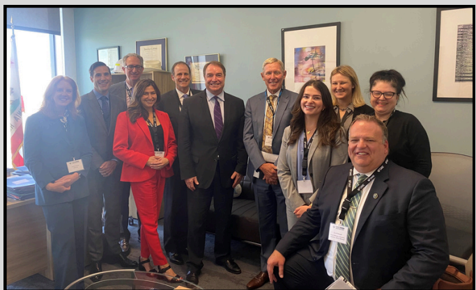
MEETING WITH CONSUMER ATTORNEYS OF CALIFORNIA