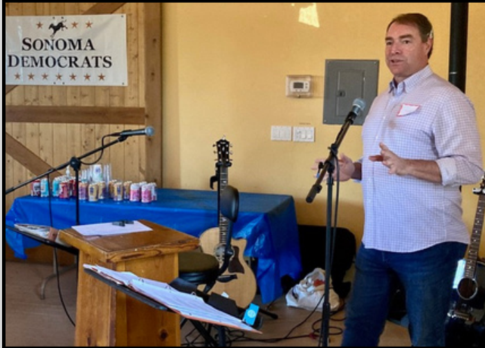
SPEAKING AT SONOMA VALLEY DEMOCRATS SPRING SOCIAL AND FUNDRAISER

Even though I'm staying busy up in Sacramento during the week, I greatly value my time at home connecting with constituents in AD12. I have had many great opportunities to attend events, tours, and productive meetings with constituents throughout the North Bay in both Marin and Sonoma Counties. Here are some snapshots of some of the meetings and events my office participated in over the past month. As always, our door is open, if you want to schedule a meeting or send an event invite, please reach out through our website by clicking here .