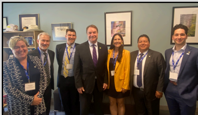
MEETING WITH CAMPUS LEADERSHIP FROM THE UNIVERSITY OF CALIFORNIA, BERKELEY