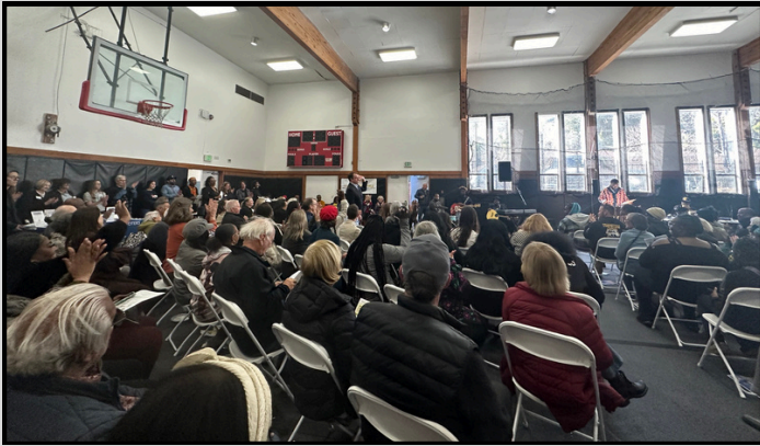
ATTENDED MARIN CITY'S ANNUAL MARTIN LUTHER KING JR. DAY CELEBRATION

Even though I'm staying busy up in Sacramento during the week, I greatly value my time at home connecting with constituents in AD12. I have had many great opportunities to attend events, tours, and productive meetings with constituents throughout the North Bay in both Marin and Sonoma Counties. Here are some snapshots of some of the meetings and events my office participated in over the past month. As always, our door is open, if you want to schedule a meeting or send an event invite, please reach out through our website by clicking here .