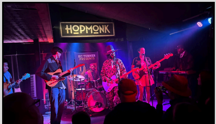
HOPMONK TAVERN IN NOVATO HOSTED BENEFIT CONCERT FOR LA FIRE DEPARTMENT FOUNDATION