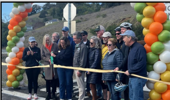
CELEBRATED THE OPENING OF THE SMART MULTI-USE PATHWAY IN SAN RAFAEL