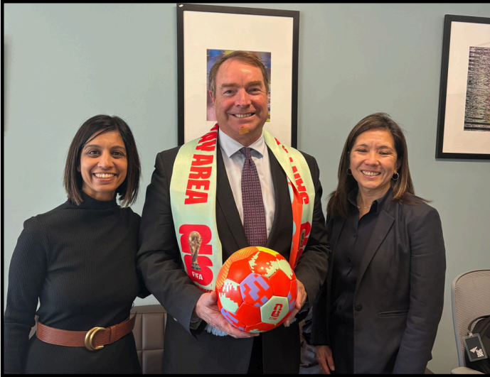
MET WITH ORGANIZERS FOR THE 2026 FIFA WORLD CUP IN THE BAY AREA

It's especially exciting when I have the opportunity to meet with constituents from AD12 lobbying out in Sacramento! Here are some snapshots of some of the meetings and events my Capitol office participated in over the past month. As always, our door is open, if you want to schedule a meeting or send an event invite, please reach out through our website by clicking here .