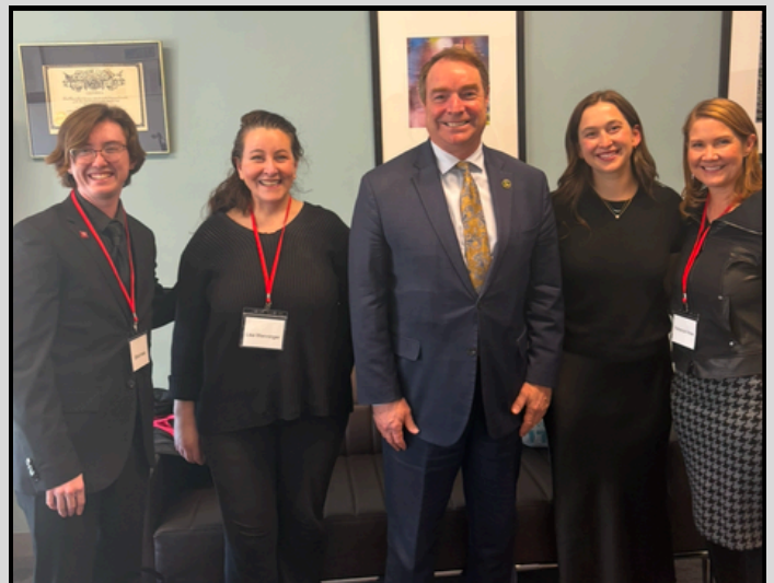
MET WITH CALIFORNIA ASSOCIATION OF MARRIAGE AND FAMILY THERAPISTS