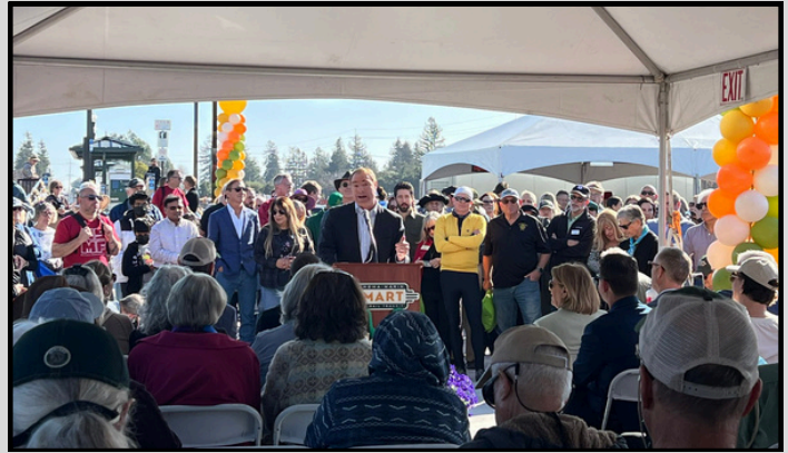
CELEBRATED PETALUMA NORTH SMART STATION RIBBON CUTTING