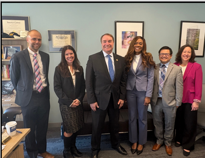
MET WITH MCE CLEAN ENERGY AND SONOMA CLEAN POWER TO DISCUSS ENERGY POLICY