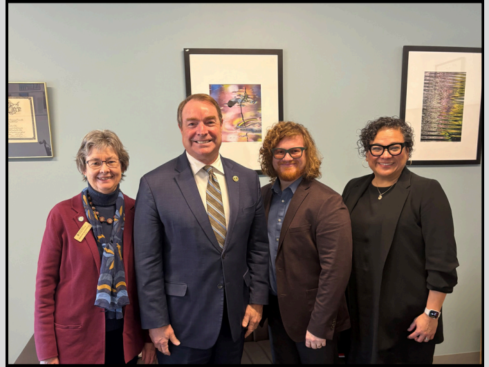
MET WITH SANTA ROSA JUNIOR COLLEGE SUPERINTENDENT AND TRUSTEES