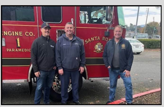
HELPED OUT AT THE SANTA ROSA FIRE FIGHTERS LOCAL 1401 TOY DRIVE AND PANCAKE BREAKFAST