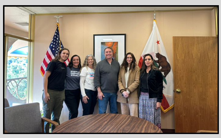
MET WITH MARIN PARENTS AND STUDENTS TO DISCUSS CONCERNS FACING TRANSGENDER STUDENTS