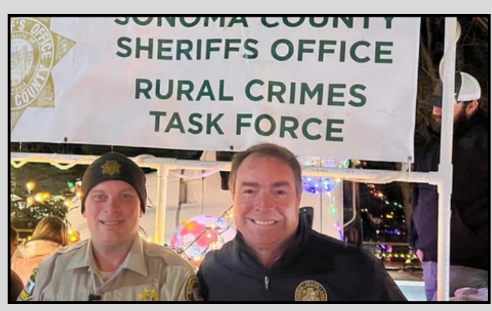
JOINED THE SONOMA COUNTY SHERIFFS OFFICE FOR THE PENNGROVE HOLIDAY PARADE OF LIGHTS