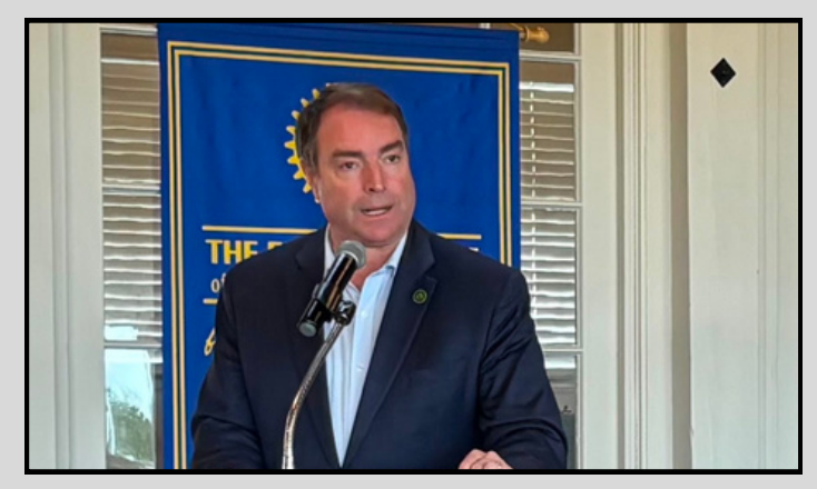
JOINED THE ROTARY CLUB OF PETALUMA FOR LUNCH AND A LEGISLATIVE UPDATE

I greatly value my time at home connecting with constituents in AD12. I have had many great opportunities to attend events, tours, and productive meetings with constituents throughout the North Bay in both Marin and Sonoma Counties. Here are some snapshots of some of the meetings and events my office participated in over the past month. As always, our door is open, if you want to schedule a meeting or send an event invite, please reach out through our website by clicking here.