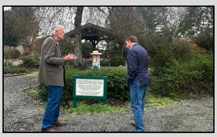
TOURED THE TRADITIONAL MEDICINALS FACTORY IN SEBASTOPOL