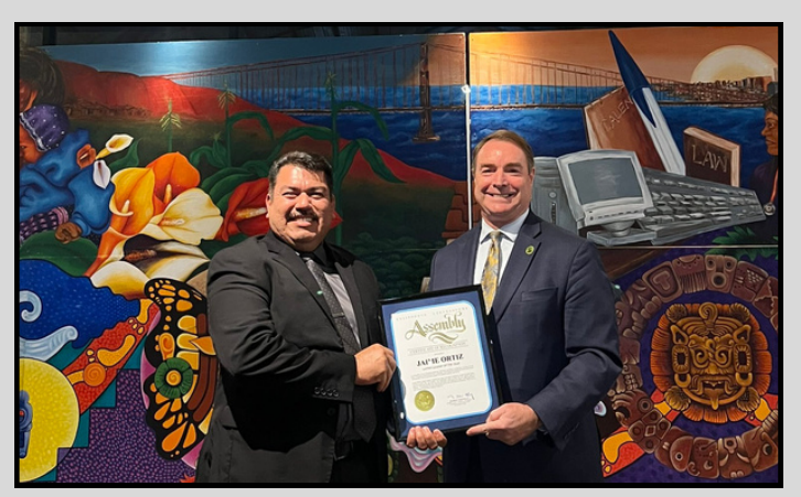
ENJOYED A HOLIDAY DINNER WITH MARIN LATINO LEADERS