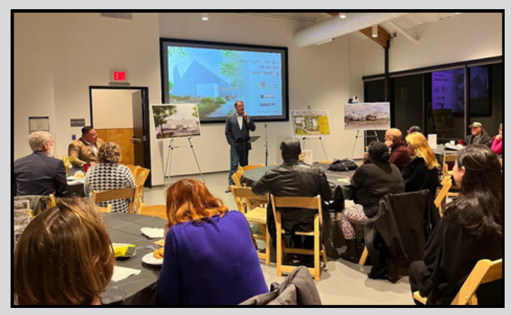
CELEBRATED PHASE ONE OF THE HEARN COMMUNITY HUB PROJECT WITH SONOMA LIBRARY AND THE CITY OF SANTA ROSA