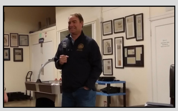
SPOKE AT THE SOUTHERN SONOMA DEMS HOLIDAY PARTY