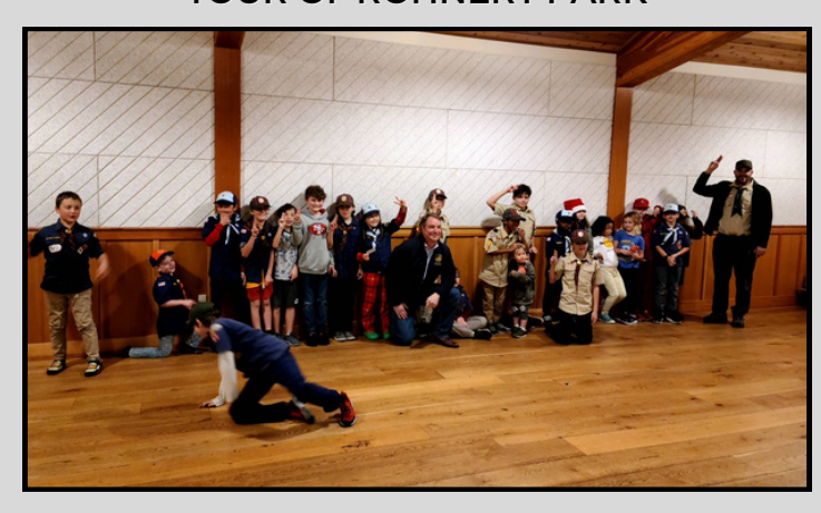
SPOKE ABOUT ENVIRONMENTAL STEWARDSHIP AND COMMUNITY SERVICE WITH MILL VALLEY PACK 133