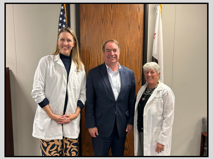
DISCUSSED LEGISLATIVE PRIORITIES WITH THE CALIFORNIA COALITION FOR REPRODUCTIVE FREEDOM