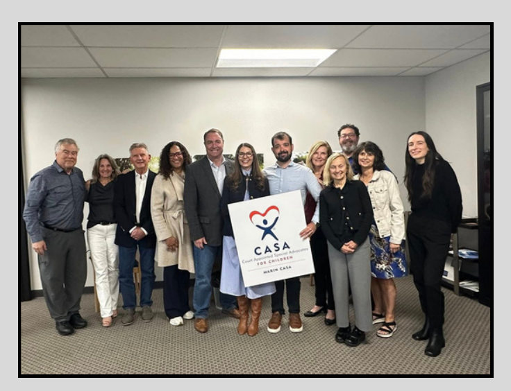
MET WITH MARIN COURT APPOINTED SPECIAL ADVOCATES TO DISCUSS WAYS TO SUPPORT OUR LOCAL FOSTER YOUTH