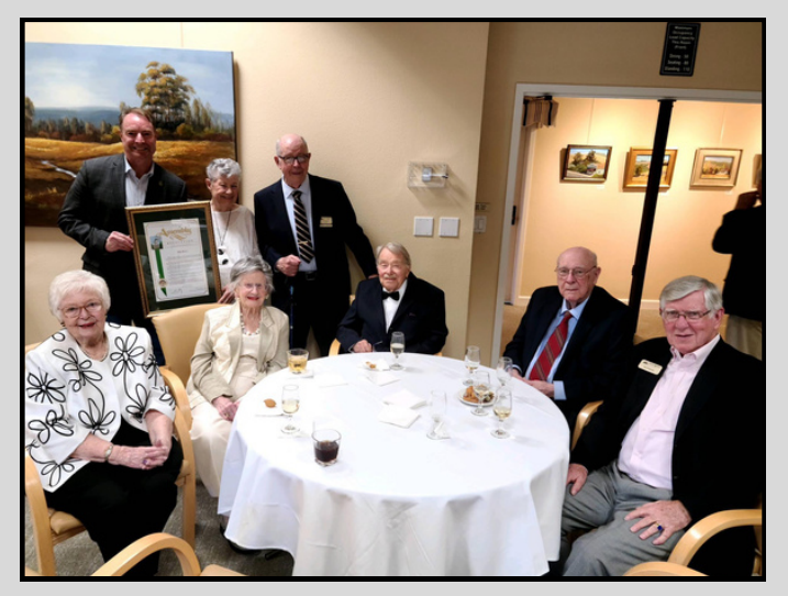
HONORED VILLA MARIN WITH A RESOLUTION AT THEIR 40<sup>TH</sup> ANNIVERSARY CELEBRATION