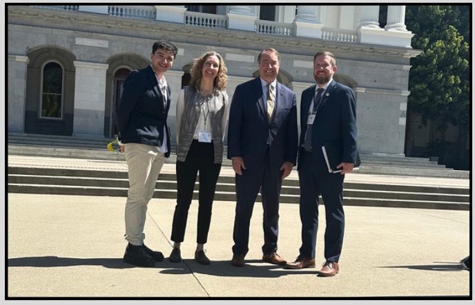
JOINED CALCAPA TO DISCUSS COMMUNITY ACTION ON THEIR ADVOCACY DAY