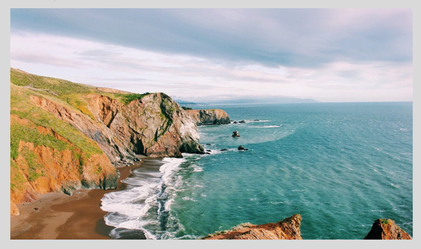
Damon Connolly Assemblymember, 12th District