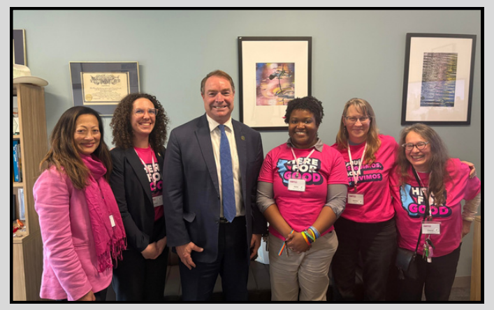
DISCUSSED REPRODUCTIVE AND GENDER AFFIRMING HEALTHCARE WITH PLANNED PARENTHOOD CALIFORNIA ACTION

It's especially exciting when I have the opportunity to meet with constituents from AD12 lobbying out in Sacramento! Here are some snapshots of some of the meetings and events my Capitol office participated in over the past month. As always, our door is open, if you want to schedule a meeting or send an event invite, please reach out through our website by clicking <u>here</u>.