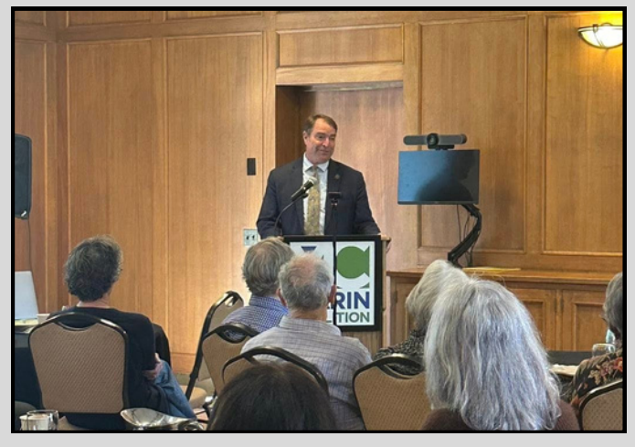
JOINED MARIN COALITION TO GIVE A LEGISLATIVE UPDATE

Even though I'm staying busy up in Sacramento during the week, I greatly value my time at home connecting with constituents in AD12. I have had many great opportunities to attend events, tours, and productive meetings with constituents throughout the North Bay in both Marin and Sonoma Counties. Here are some snapshots of some of the meetings and events my office participated in over the past month. As always, our door is open, if you want to schedule a meeting or send an event invite, please reach out through our website by clicking <u>here</u>.