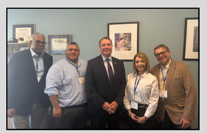
MET WITH ALIADOS HEALTH REPRESENTATIVS FROM AD12